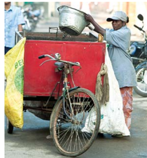
TOUGH JOB: Green friends collect and segregate waste throughout the day