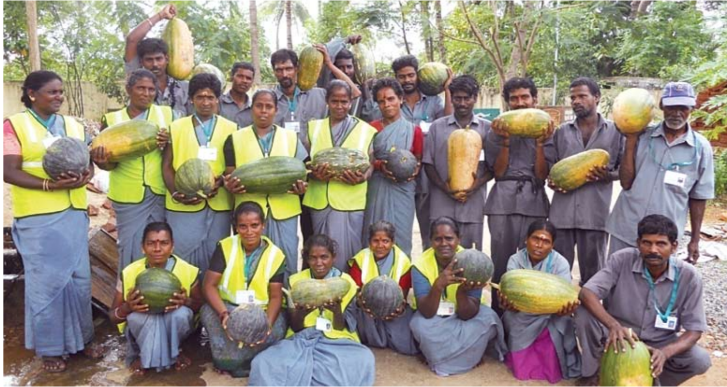
NOTHING GOES WASTE: Green friends hold melons grown at the compost park at Kundrathur, Chennai, India