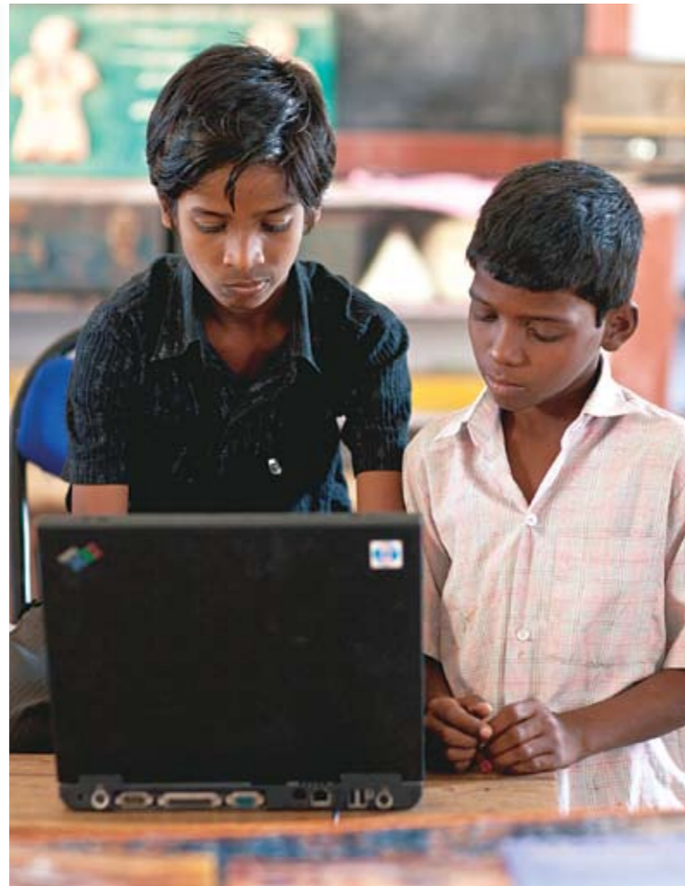
VIRTUAL REALITY: Electrolux donated computers to us

Consider the facts: With over one billion people, India has just over 300 million bank accounts. The bottlenecks to make banking inclusive in rural India are many. So if it is credit worthiness of the poor or problems of reach and illiteracy, the social imperative of reaching out to the poorest of the poor has become critical. Thus, CCEs are spaces where the poor can use various banking services, including cash transactions - deposits and withdrawal, insurance, various loan options. The poor are flocking to new technology and