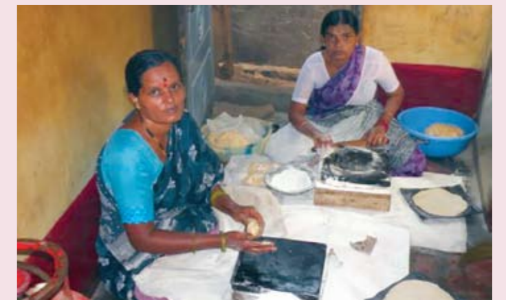
BREAD OF LIFE: SHG women make world famous bread

The inexpensive rotis are popular among the vast migrant populations in the state, more so because the packaged rotis can be stored and eaten even after two months after it is made. The traditional small business has also become a source of livelihood for thousands of people in the state, most of them with poor literacy. "The critical aspect is to find link markets for women involved in the trade," she says. The enterprise has encouraged another SHG in the area to take up the activity.