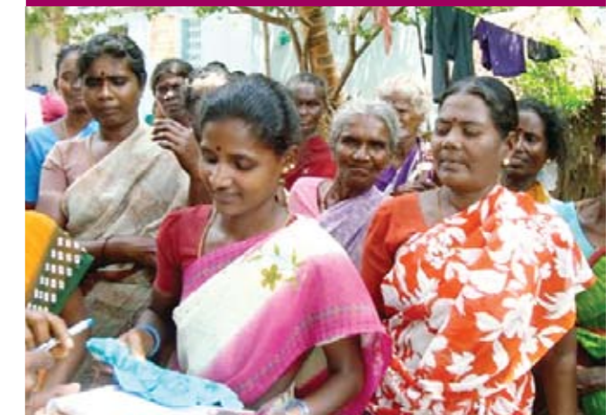
SCRIPTING VICTORY: Members display their newly-acquired land documents