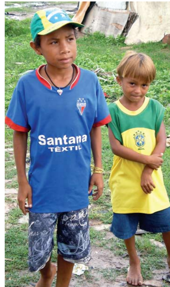
TWIN APPEAL: Hand in Hand India and World Vision, Brazil, have come up with ideas to transform the lives of people